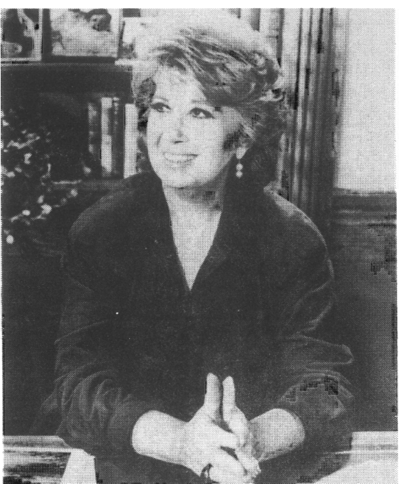
Beverly Sills will grace the Opera House stage in April for the Creative Living Series.